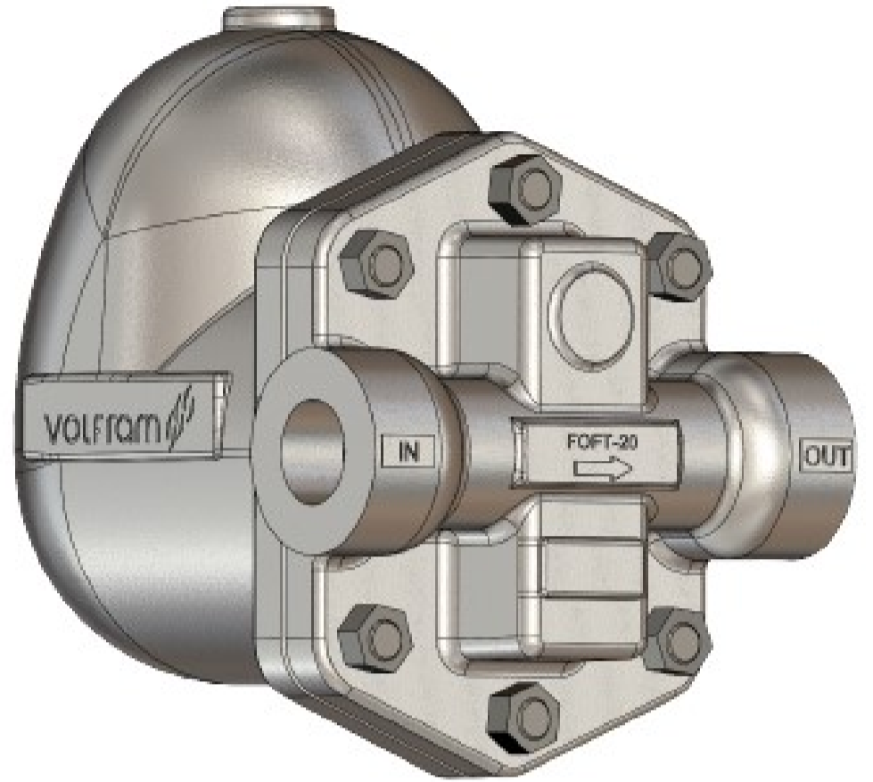
BALL FLOAT STEAM TRAP SCR ENDS (FOFT-20H)