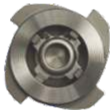
Non Return Valve