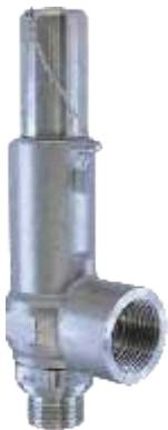
SS Safety Valve