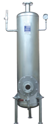
Flash Steam Separator with Inbuilt Float Trap