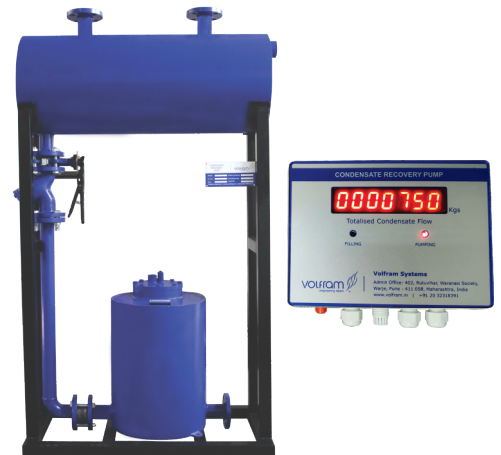
Mechanical Condensate Pump with flow totalizer