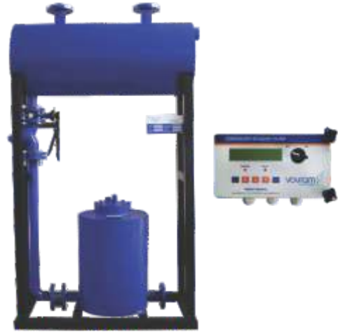
Condensate Recovery System