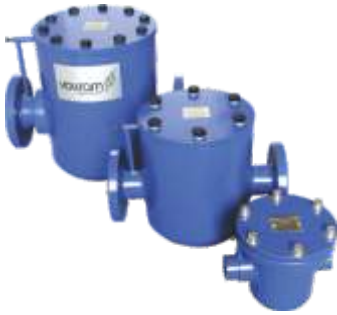
Rotating Plug Float Trap