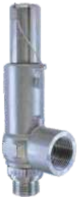
SS Safety Valve