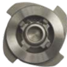
Non Return Valve