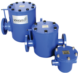
Rotating Plug Float Trap