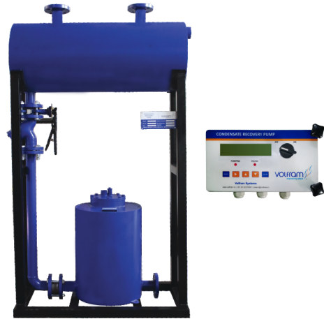
Condensate Recovery System