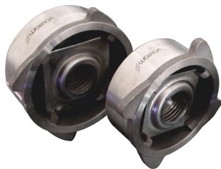
Non Return Valve