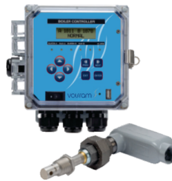
Auto Boiler Blow down System