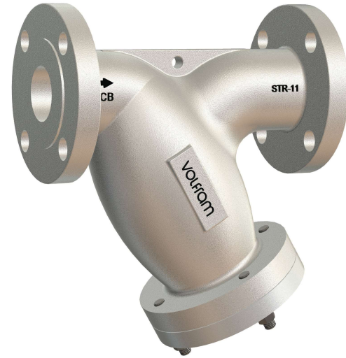
'Y' - TYPE STRAINER (STR-11)