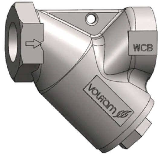
'Y' - TYPE STRAINER (STR - 10)